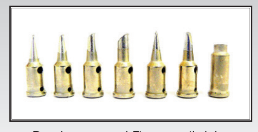
Replacement Tips available