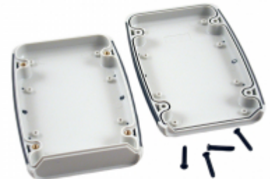
Key Internal Features