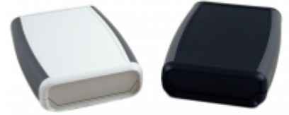
Light Grey or Black Enclosure Color