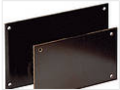
Mounting panel, laminated paper