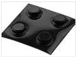
Rubber feet, self-adhesive

22009000 GF Polyurethane, 65-75 Shore Black