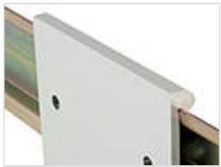
Metal top hat rail adapter for DIN rail DIN EN 60715 TH 35

22035000 TSH 35 Black, similar to RAL 9005