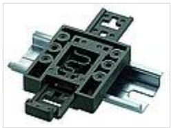
Universal DIN rail holder TSH 35, polyamide

22009000 GF Polyurethane, 65-75 Shore Black