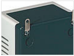
Wall brackets, nickel-plated sheet steel