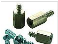
Screws (SHR) and distance bolts (DIBLZ) for mounting bosses in plastic enclosures

34035050 TSH 35 AL - 50 Width 50 mm, natural colour anodised 34035100 TSH 35 AL - 100 Width 100 mm, natural colour anodised