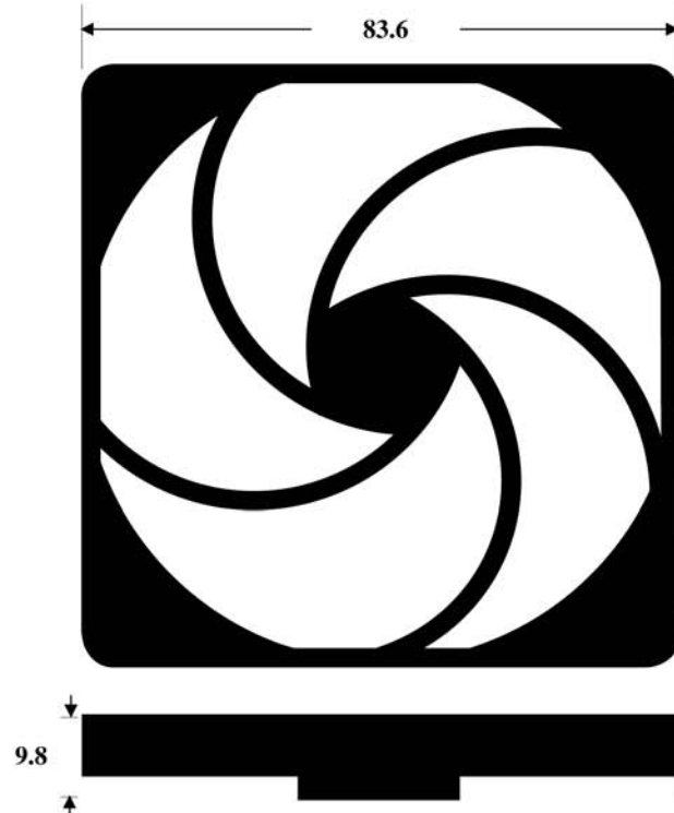
Media "M" / M80-45