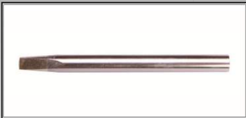
Replacement Tips available