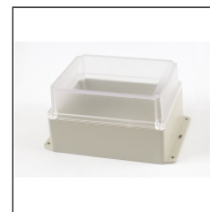
Some models supplied with deep lids.