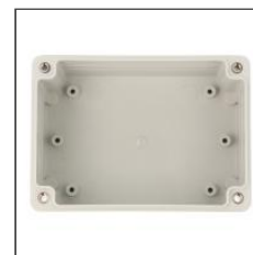
Internal mounting points for PC boards or panels