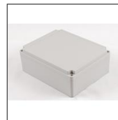
Some models supplied with styled lid.