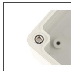
Features corrosion resistant inserts for lid assembly