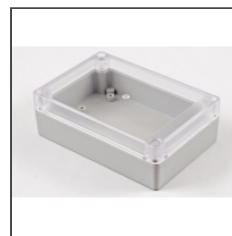
Clear Lid (polycarbonate version shown)