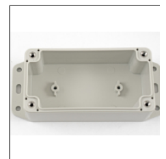
Internal DIN rail mounting point.